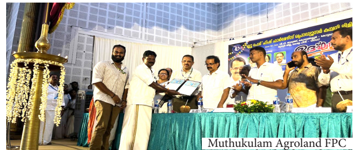
Muthukulam Agroland FPC

Adding to the significance of the occasion, the first-ever Fish Farmers Producer Company (FPC) in Kerala, Blue Pearl Fish Farmers Producer Company Limited, was inaugurated during the event. The Hon'ble Minister unveiled the company's logo, marking the beginning of a new chapter in Kerala's fisheries industry.