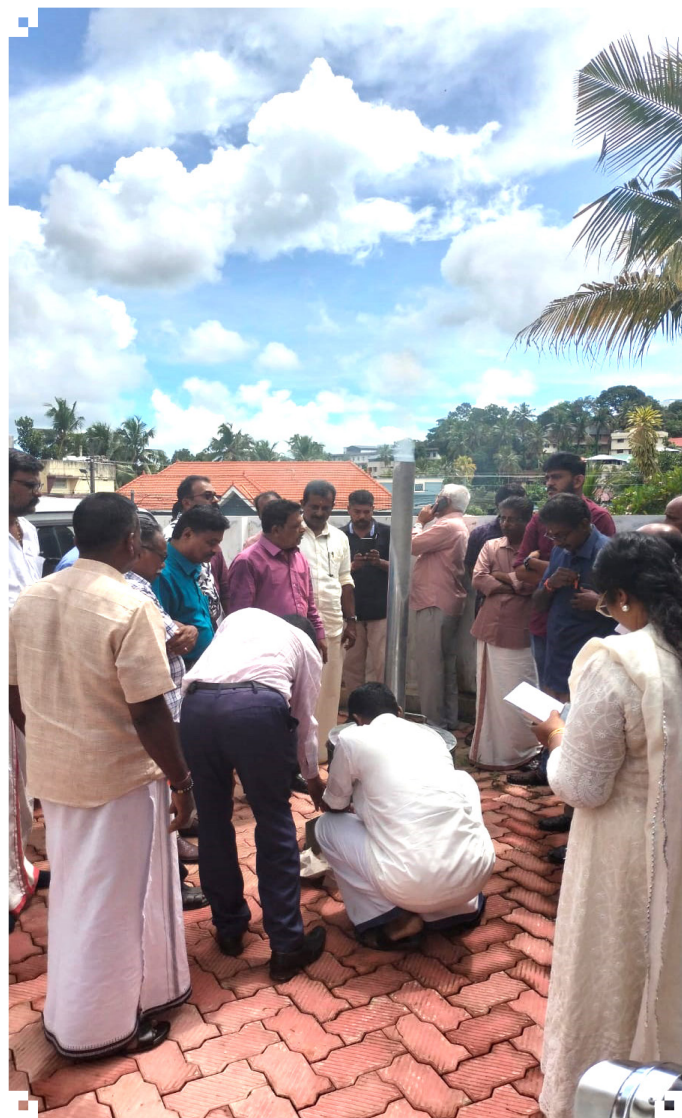
Demonstration of production of Biochar Manure during the Trainers Training program held at CISSA

Biochar production protocols in India are yet to be standardized. A low cost portable biochar kiln with proper design and operational process can be considered as an economically viable option for rainfed areas in developing countries for efficient recycling of unused and excess crop residues. There is a different ways to make biochar. It involves heating of biomass with little or no oxygen to drive off volatile gasses. The carbonization process undergoes three steps viz. removal of moisture and some volatiles compounds which are followed by conversion of unreacted residues to volatiles, gasses and biochar, and finally formation of recalcitrant material called biochar through slow chemical rearrangement. Various pyrolysis technologies produce different proportion of biochar and other by-products, such as bio-oil and syngas. The gaseous bio-energy products may be used to generate electricity. Bio-oil may be used directly for low-grade heating applications as well as a diesel substitute after suitable treatment.