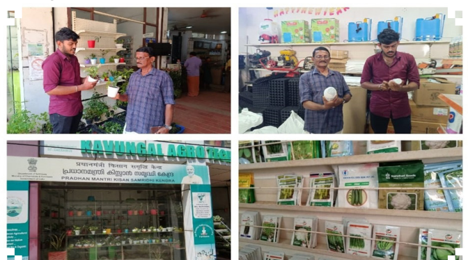
Team Visited Kavungal Agrotech