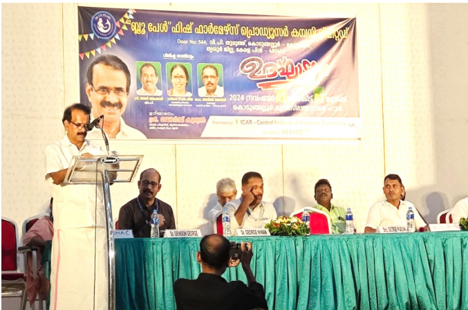
Shri. George Kurian, Hon'ble Minister for Fisheries, Animal Husbandry, & Dairying

Adding to the significance of the occasion, the first-ever Fish Farmers Producer Company (FPC) in Kerala, Blue Pearl Fish Farmers Producer Company Limited, was inaugurated during the event. The Hon'ble Minister unveiled the company's logo, marking the beginning of a new chapter in Kerala's fisheries industry.