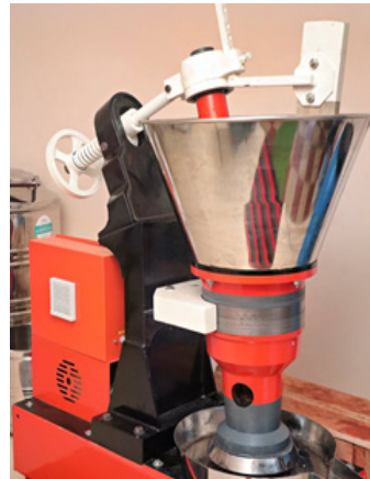
rotary machine (chuck)

The company has started the new venture by taking a loan from State Bank of India through Agriculture Infrastructure Fund (AIF). It is expected that effective collaboration between ONDC, Mystore and other FPOs will increase sales.