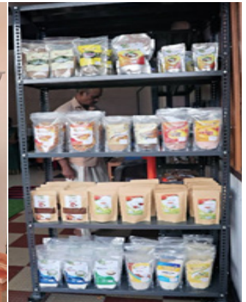
Healthy Bowl products

For better marketing of the company's products, the products have been brought to the market under the brand name 'Healthy Bowl'. Procedure for registering the brand trademark is also underway. Pure coconut oil, virgin coconut oil, coconut milk, coconut powder, coconut chutney, pickles, vinegar from coconut water, millet products, spice powders and many other fruits and vegetable products. It is worth mentioning that the company's products have already been delivered to customers through Mystore. Expect to receive more orders in the following days